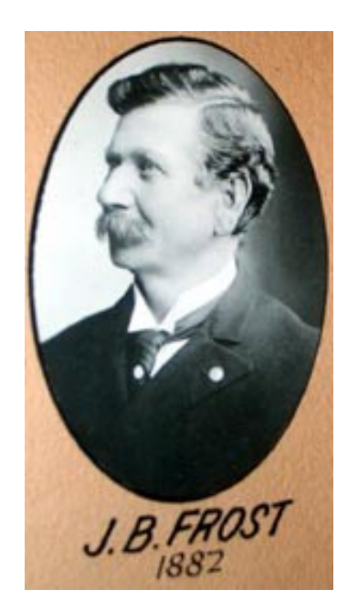
Naperville Postmaster 1881 Grain Commissioner Chicago Board of Trade

Died May 30, 1923 in Naperville, DuPage County, Illinois and buried in the Naperville cemetery with the G.A.R. conducting the funeral service.